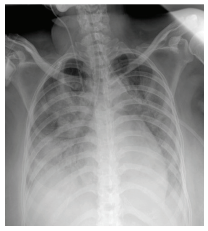
Figure 2. A 35-year-old, laboratory-confirmed COVID-19, pregnant woman with 25 weeks of pregnancy presented with fever and dyspnea. The patient developed hypoxic respiratory failure and was admitted to intensive care unit. Anteroposterior chest radiograph shows an ARDS pattern with ill-defined alveolar consolidation bilaterally in the predominantly lower zones

Descriptive analyses were performed for the characteristics of the patients. The normally distributed continuous random variables were expressed as the mean \pm standard deviation