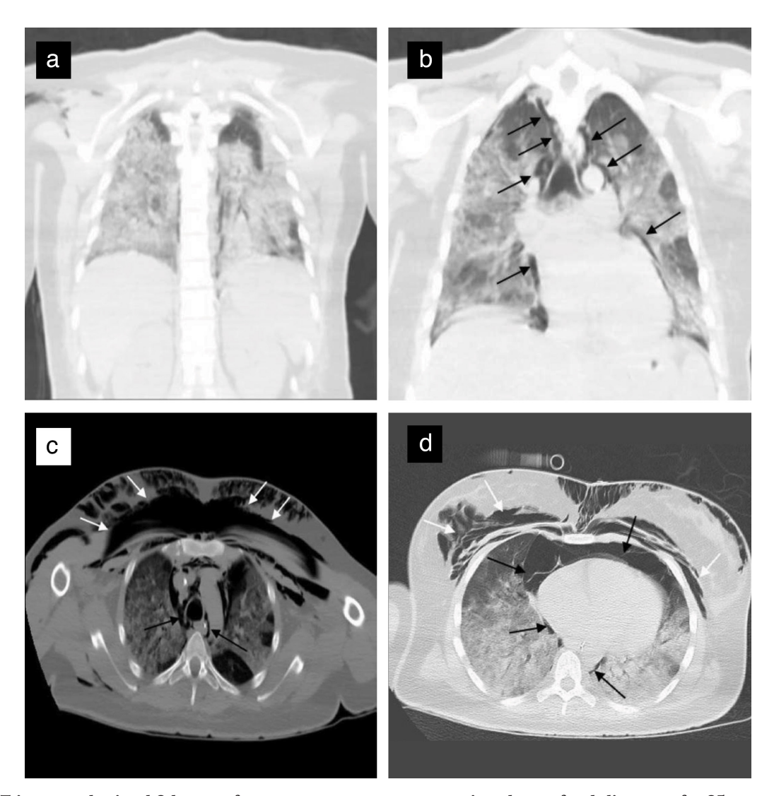
Figure 3. CT images obtained 2 hours after emergency cesarean section due to fetal distress of a 25-year-old woman with COVID-19. Coronal images (a,b) show bilateral diffuse and multiple patchy ground-glass opacities with partial consolidation. CT severity index is 22 and classified as severe. All CT images (a-d) show air in the mediastinum which outlines mediastinal organs (black arrows). Also, axial CT images (c,d) show extensive subcutaneous emphysema (white arrows) in the anterior chest wall

CT: Computed tomography, COVID-19: Coronavirus disease-2019