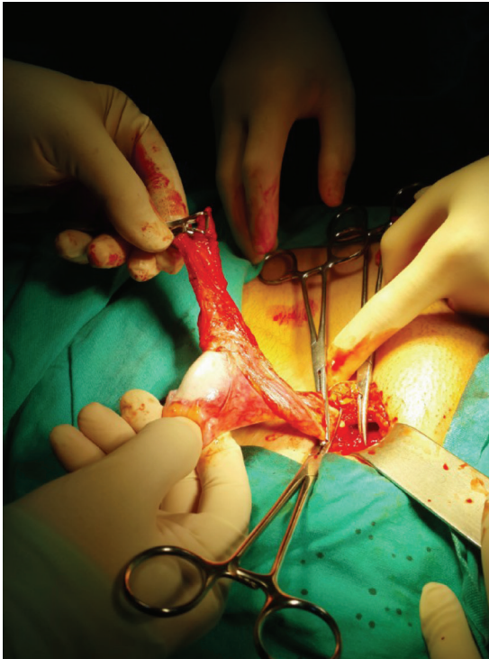
Figure 1. Gonadectomy from inguinal canal

Keywords: testicular feminization, gonadectomy, 17-hydroxylase insufficiency