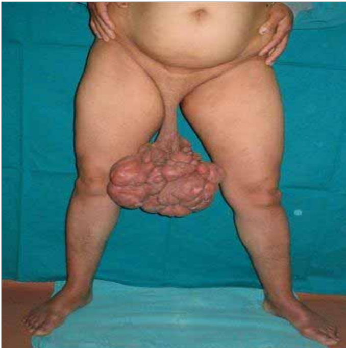
Figure 1. Patient at presentation, showing large mass hanging from thick pedicle and impeding walking