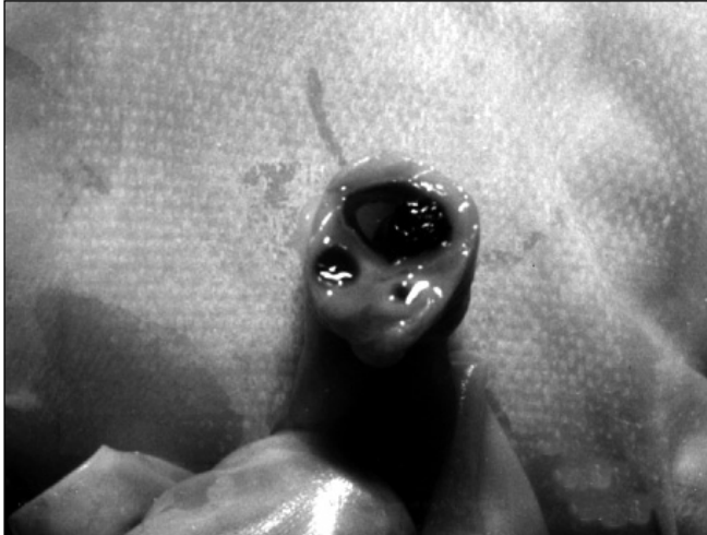
Figure 2. Section of umbilical cord (formalinized) showing three vessels including one dilated vein containing blood clot/thrombus.