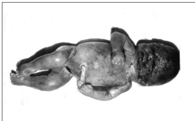
Figure 1. Clinical photograph showing hydroptic state.

over the body of the fetus but more so on face. There were no malformations on external and internal examinations. Feto-placental unit was intact as the cord had not been sectioned at delivery. Umbilical cord examination revealed a figure of eight knot. Antenatal and postnatal investigations of the mother and fetus excluded the possibility of immune hydrops fetalis and skeletal dysplasia (Table 1). Chromosomal analysis was not carried out because fetus and the placenta were sent in formalin. Fetal autopsy including histopathological examination of the placenta and fetal liver did not yield any evidence (eg. abnormal cells, inflammation, extramedullary hematopoiesis) for metabolic (eg. storage disorders) and infective causes, as well as alpha thalassemia that are commonly associated with NIHF (Table 1; Figure 2,3).