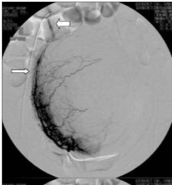
Figure 1. Uterine artery catheterization and visualizing the arterial supply of the leiomyoma. Thin arrow to the right: External iliac artery. Thick arrow to the left: Uterine artery.

the arteries were embolized a final arteriogram was obtained generally showing a residual flow to normal myometrial branches (Figure 2).