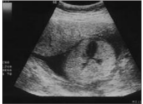
Figure 1. The fetus had massive ascites and inverted diaphragms (Figure 1a), bilateral symmetrically expanded hyperechogenic lungs, dilated airways (Figure 1b)s

striking distension of the developing airspaces. There was 50 cc of serous ascites. The esophagus and other organs were normal.