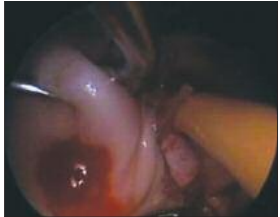
Figure 2. Two separate cervixes with Foley catheter in the left orifice