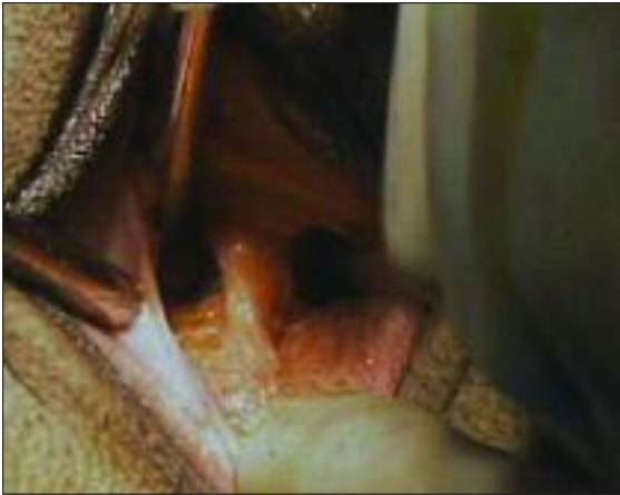
Figure 1. Complete longitudinal vaginal septum