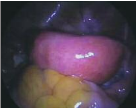
Figure 3. Laparoscopic view: Broad-based uterine fundus