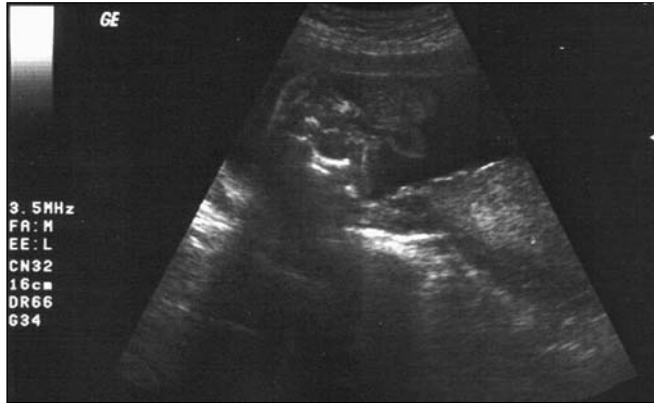
Figure 1. Extracorporeal location of fetal heart was seen.