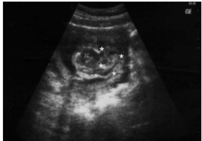
Figure 4. Frontal encephalocele was detected during the ultrasonographic examination.

cystic mass containing solid component possibly “brain tissue” was detected by ultrasound. Cytogenetic analysis by cultured amniotic fibroblasts revealed a 46 XY karyotype. Following the initial evaluation pregnancy was terminated. Pathologic examination confirmed frontal encephalocele with amniotic band (Figure 4). Amniotic band was over the frontal region. Frontal lobe was herniated to the subcutaneous tissue from bony defect. Fetal extremities, external genitalias, anal opening, urinary bladder, kidneys, hearth and gastrointestinal system were normal. Umbilical cord contained three vessels.