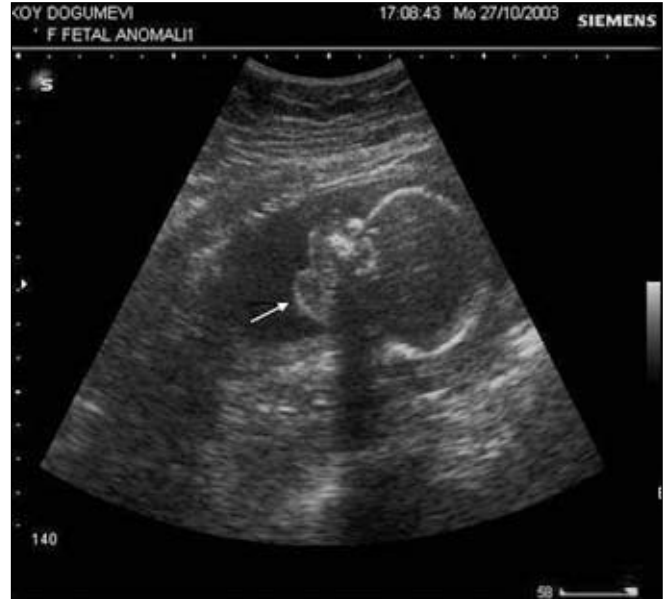
Figure 4. A complex cystic mass located on the anterior aspect of the fetal neck.

Two fetuses were diagnosed to have cervical teratomas. A complex cystic mass was found in the anterior aspect of the neck at 23 weeks. The cystic mass was well demarcated and measured 48x55 mm (Figure 4). The parents opted to terminate the pregnancy after antenatal counseling. A 880 g weighing male infant was delivered. Postmortem physical