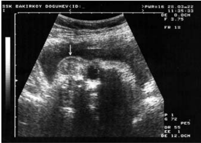
Figure 3. An ultrasound scan of abnormal face with a mass around the fetal cheek.