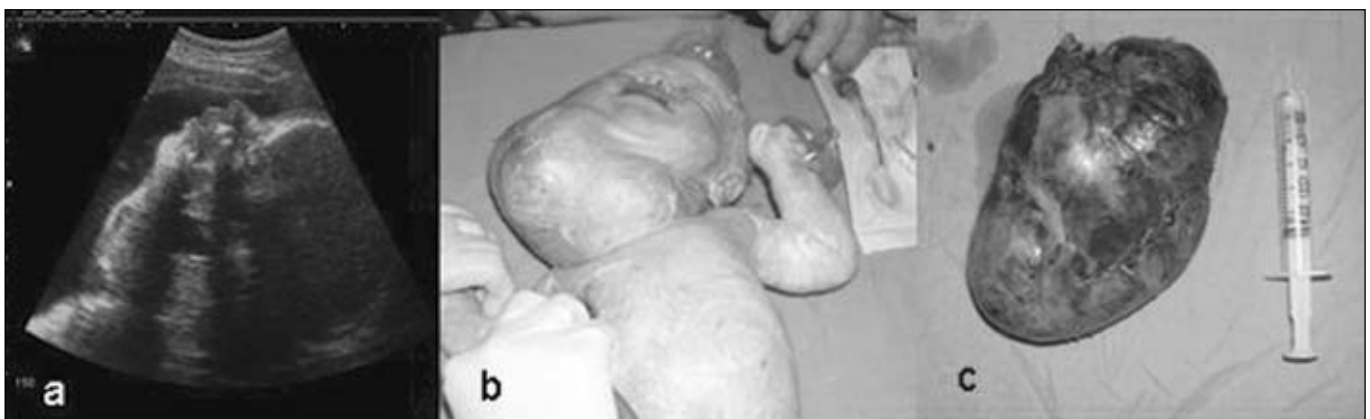
Figure 5. (a) Sagittal scan of a giant multicystic complex neck mass. (b) Frontal view of the infant following delivery. (c) Photograph of the resected neck tumor.

Three fetuses had ovarian tumors. Two fetuses were delivered with birth weights of 3390 and 3140 g respectively at 38 weeks by elective cesarean. Another fetus was delivered spontaneously with a birth weight of 3300 g at 40 weeks. One of the tumors was resected on postpartum day one beca-