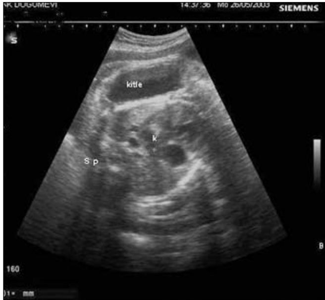
Figure 1. Ultrasound image of large cystic tumor located on the left side of the trunk.