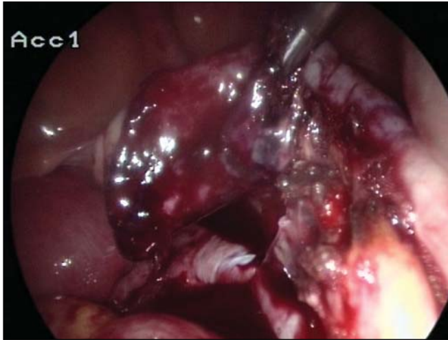
Figure 1. Laparoscopic imaging of ectopic pregnancy in the mesoappendix.

A second look laparoscopy was done. The ectopic pregnancy was seen at the mesoappendix (Figure 1). The appendix seemed to be infectious. The pregnancy was removed and appendectomy was performed by laparoscopy. Post-operative recovery was excellent. \beta -hCG levels decreased rapidly. The histological examination revealed the occurrence of ectopic pregnancy in the mesoappendix and appendicitis was confirmed (Figure 2).